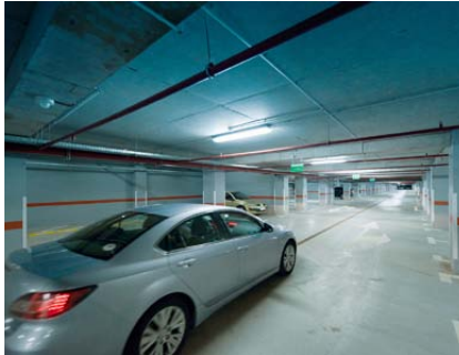
Monitoring in underground garages (safety)