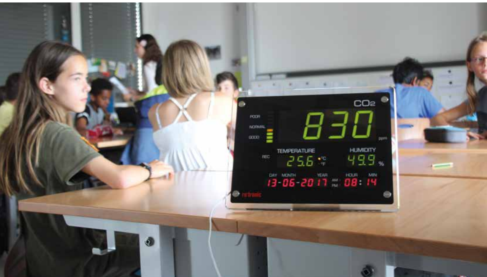
CO 2 display from Rotronic in use in Class 5 / 6B at Köniz-Buchsee Primary School (Switzerland).

Do you still remember your schooldays? Following a lesson in mathematics, the air in the classroom was stale and stuffy. This problem has grown worse today as law requires many buildings to be airtight, meaning basic ventilation no longer exists. This “Meine Raumluft” an independent platform whose aim it is to improve the quality of indoor air wishes to change. In its project involving 100 Swiss classrooms the quality of room air was measured using CO 2 displays from Rotronic. They enable easy and practical measurement of air quality, temperature and humidity in rooms.